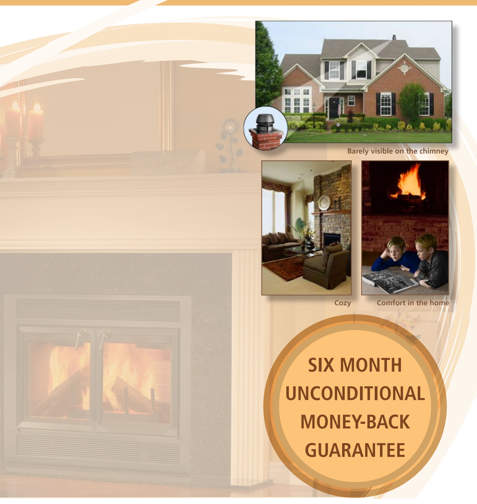
A better, healthier indoor climate