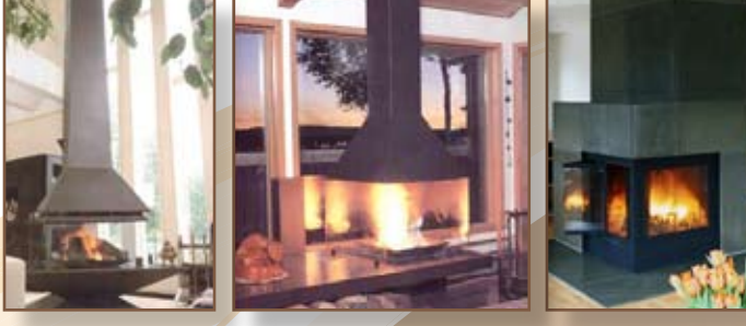
Unconventional fireplaces tend to cause smoke problems

The motor is completely maintenance free!