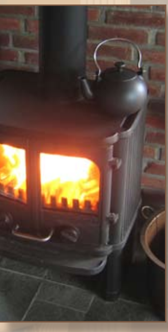
Use for stoves