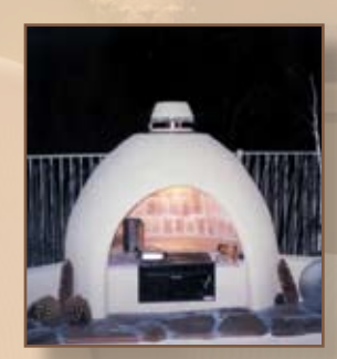
Shown on an outdoor BBO

The EXHAUSTO Chimney Fan can be used with wood or gas-fired fireplaces, stoves, baking ovens, BBQs, furnaces, boilers, etc. And the chimney fans don't care whether the chimney is new or old, tall or low, thin or thick, brick or steel!